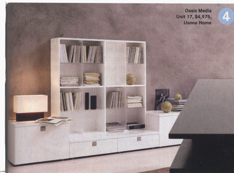
Oasis Media Unit 17, $4,975, Usona Home