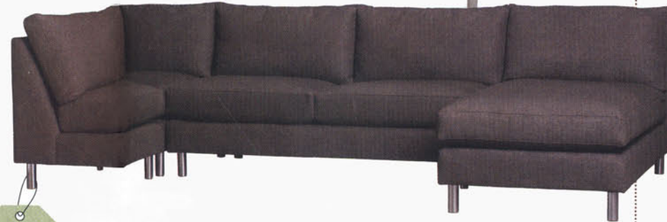
Best Deal! Annex Two-Piece Sectional, $1,348, CB2