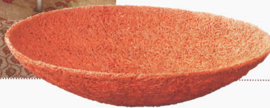
5 Organic Bowl, $75, www.vivionline.com