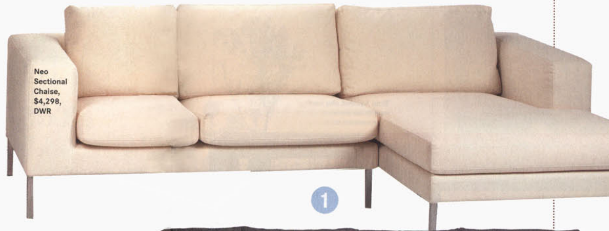
Neo Sectional Chaise, $4,298, DWR