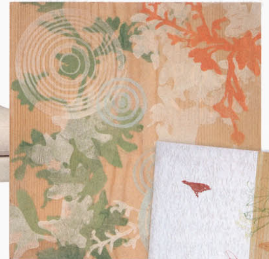
Fumi Watanabe abstract, $380, www.velocityartanddesign.com