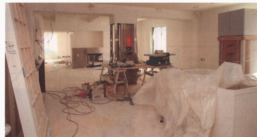
Pella™ windows and Joanne Hudson cabinetry await installation in the contemporary flat.

The architecture in this flat will mimic 18th and 19th English country styles. Upon entering the flat, guests will pass through gracious, multi-paned, glass doors which open into a truffled marble interior gallery, visible from the elevator. From the entrance, guests can move throughout the flat via a 45-foot long gallery which is bisected by a central rotunda. The flooring, from Charles Taylor & Sons, throughout the flat will consist of antiqued oak which will be hand scraped and waxed to achieve an antiqued patina. Ultimately, the flat will be decorated with 18th century American-style furniture from Quail Ridge Furniture and Doneckers.