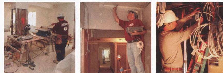
Work is in full-swing as door and window trim are measured and cut, spackle is applied and wiring is completed.

The 8th floor of the Lanesborough, designed by Cecil Baker & Associates, will feature a modern design and furnishings including pieces from Ligne Roset and Material Culture. The architecture within this residence is characterized by broad horizons and vistas punctuated by varying ceiling heights which capture natural light from all four exposures. Eventually, diagonally-set cherry-stained, maple flooring will add great energy to the rectilinear nature of the wall placements. The flat will reflect a cool palette and will consist of grays, creams and celadon hues. Soon, the flat will be decorated and furnished with a range of contemporary lines and textures, woods and metals and fabric and leather.