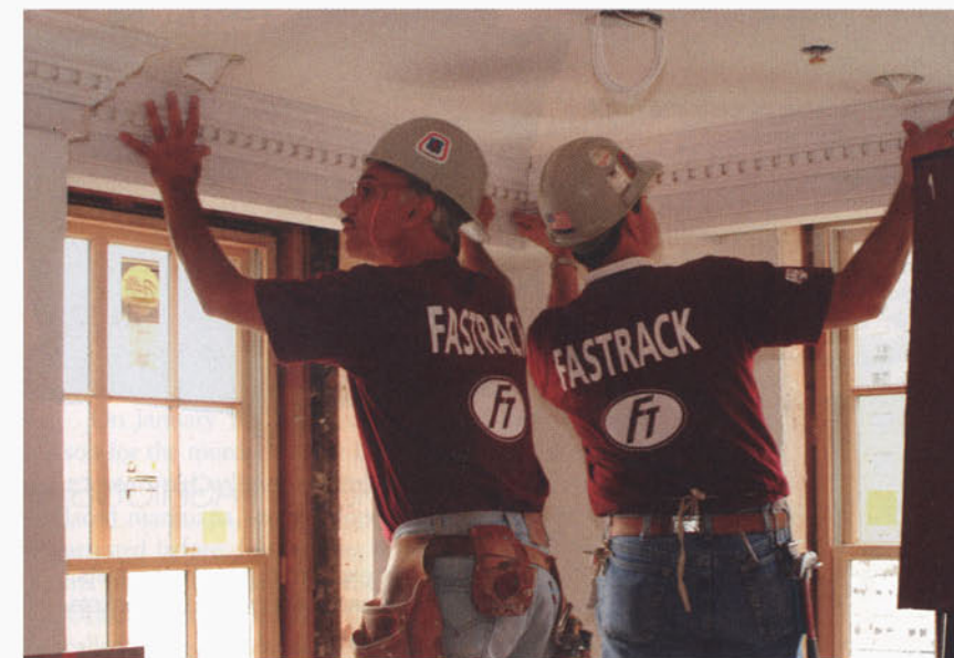
Fastrack Construction workers install dentil molding in the living room and dining room of the traditional flat.